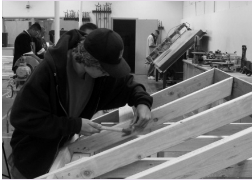
Students of GJUHSD's construction-related training programs gain lifelong skills.

Many school districts throughout California now offer construction-related training programs to high school and adult education students. By doing so, these districts give students another option after graduation, fill a need for vocational workers, and reduce the dropout rate of high school students who often think typical education programs lack real world relevancy.